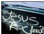
Rebels With a Cross