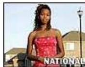
This Year, No Black Debutante