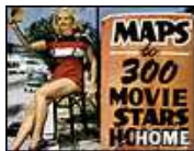
Please Don't Touch the Celebrities