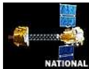
NASA Budget Delays Missions