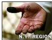
The New Rector of St. Patrick's