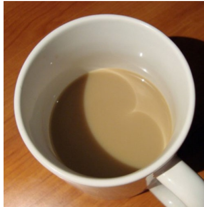
FIGURE 3. This cusp appears due to the way rays bounce off the surface.